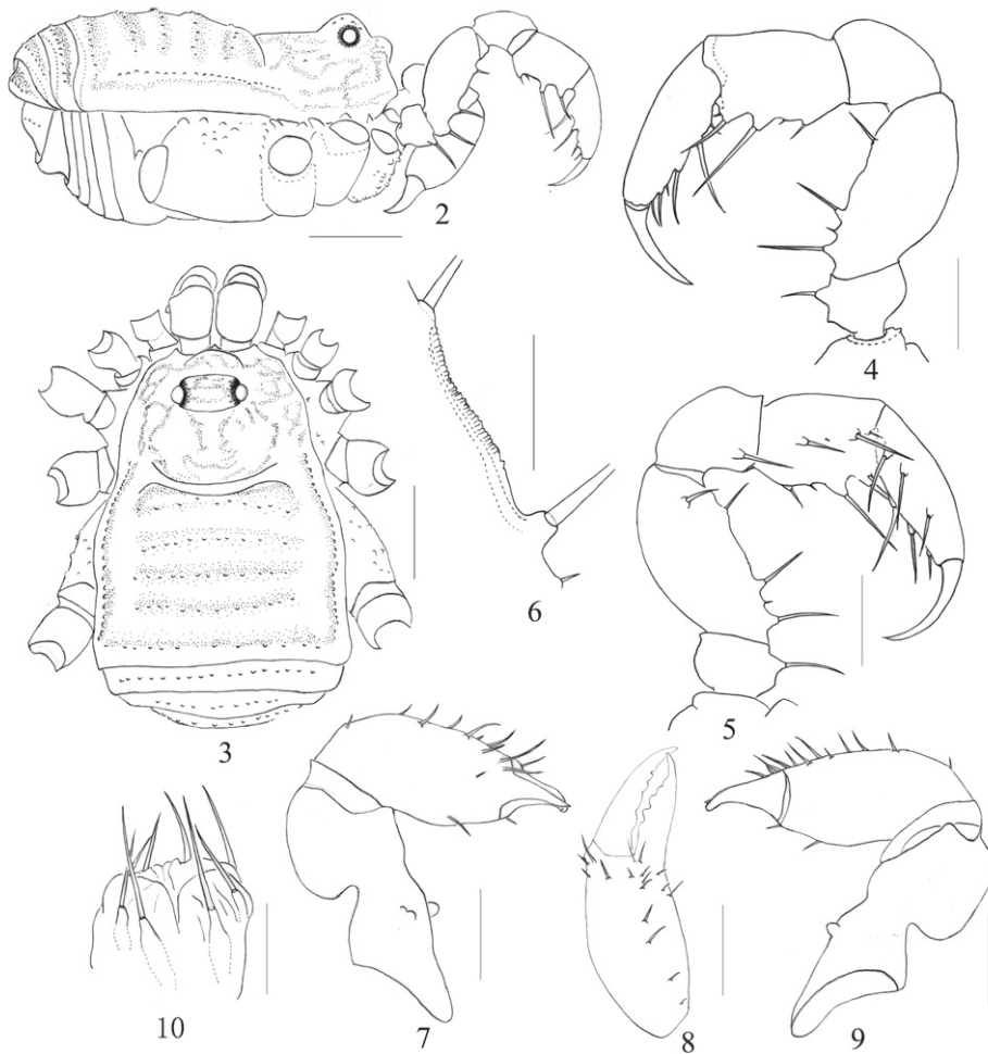
Figures 2–10. Tithaeus calyptratus sp. n. 2 Male body, lateral view 3 Same, dorsal view 4 Left pedipalpus, male, posterior view 5 Same, anterior view 6 Minute serrate margin on the ventral side of femur, left pedipalpus, male 7 Left chelicera male, anterior view 8 Distal segment of the left chelicera, male, above view 9 Left chelicera, male, posterior view 10 Ovipositor. Scale bars: 1mm (1–2); 0.5mm (3–4, 6–8); 0.25mm (5, 9).

branous lobe and each lobe of the ovipositor with two ventral and two dorsal setae) are also in agreement with to the generic disagnosis of Tithaeus (as per Lian et al. 2008).